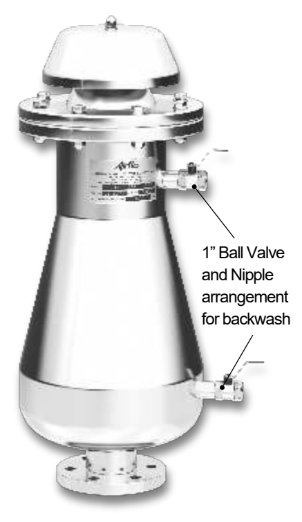
1" backflush port arrangement as standard complete with full bore Ball Valve isolators

AIRFLO Variable Orifice Air Valves are available in a variety of outlet configurations as well as with and without backflushing ports. To suit a particular application. Standard options are as follows: