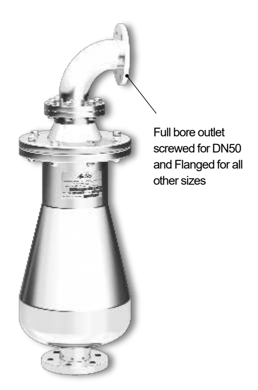
Attachment on outlet to tap off gases