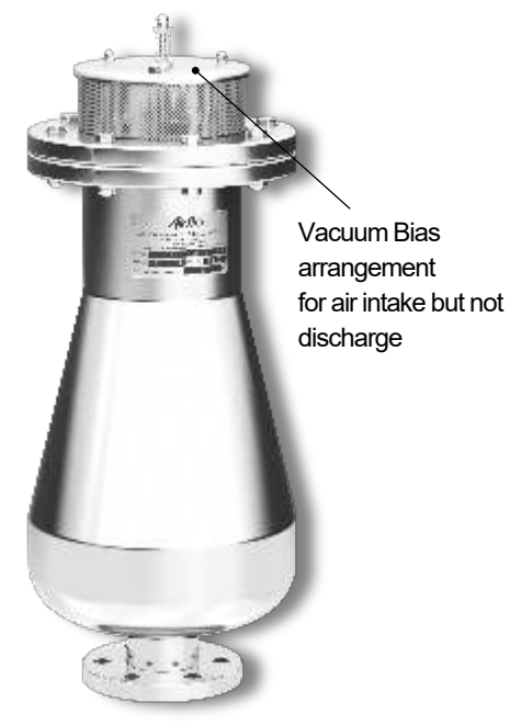
Vacuum Break Bias arrangement will break vacuum but not discharge air